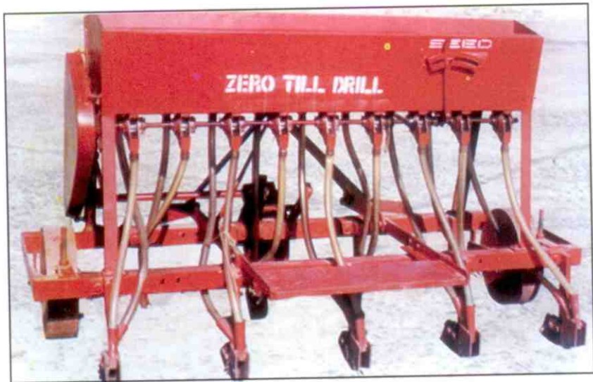
Fig 1 Tractor mounted zero till seed cum fertilizer drill

The Tractor mounted zero-till seed drill was initially developed at GB Pant University of Agriculture and Technology, Pantnagar and subsequently modified to the site needs (Fig. 1).