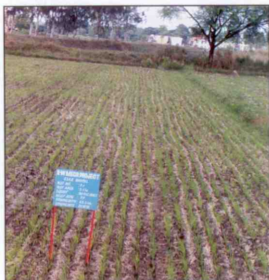
Fig 4 Zero-till drilled wheat (LOK-1) at 15 days of sowing