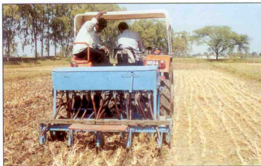
Fig 3 Field testing of zero-till drill for sowing of wheat after harvest of rice